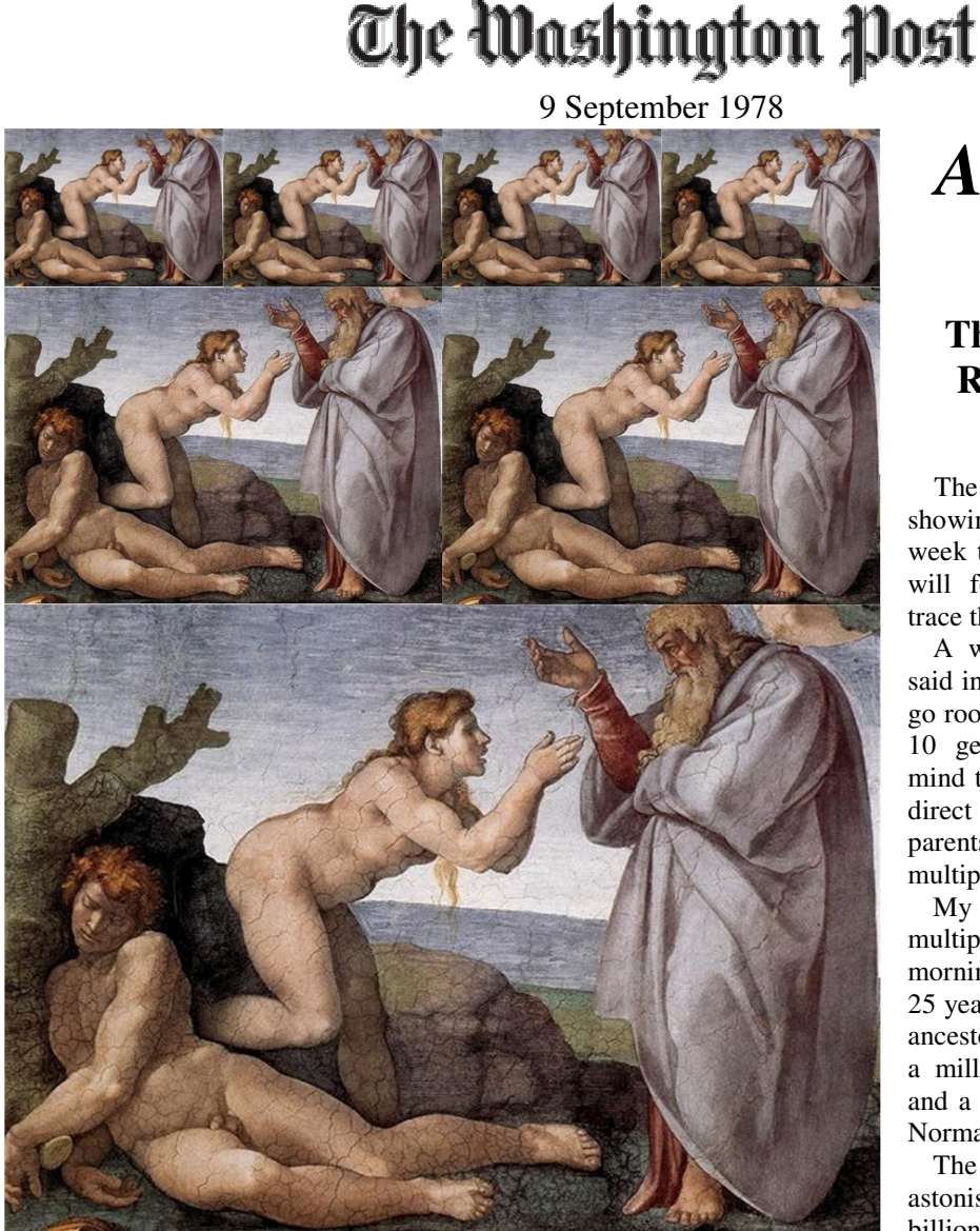
Michelangelo's 'Creation of Eve'

The next two pages contain the article and my questions (I substituted a color picture for the original black and white one). The last page has my solution.