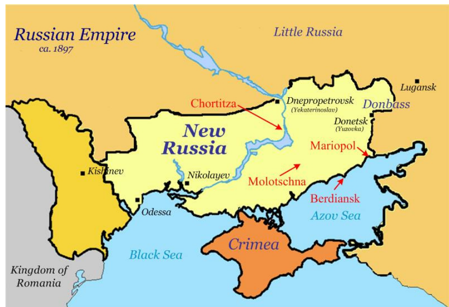
New Russia, Ukraine, with Mennonite colonies and seaports, c.1897

Several thousands of Mennonites left their homes in Danzig and Prussia to escape the “world” and to settle on the steppes of the Ukraine. Here, in an entirely heterogeneous civilization, they brought their German Mennonite culture and economic life to a full development. The Old Colony was settled by 228 families in 1789 at the mouth of the Chortitza River on the banks of the Dnieper, hence, referred to as the Chortitza Colony . The second, located some 100