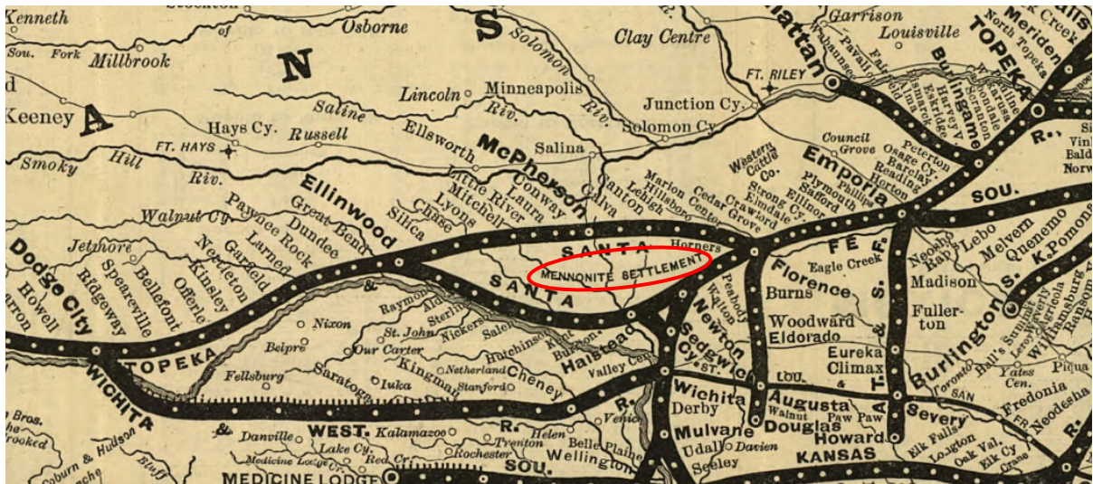
Mennonite Settlement in Kansas, including Halstead, Newton, Hillsboro, Canton, McPherson along the Atchison, Topeka & Santa Fe Railroad line. 1884 ([4])