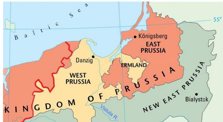
Prussia and Vistula River 1713-95

Dutch Mennonites left The Netherlands during the 16th century and settled along the European frontier of that time—the swampy Vistula Delta near Danzig. As experts in dike building and draining flooded territories they were welcome colonists. Here they had an opportunity to establish their “church without spot and wrinkle” and keep it separate from the “world” which had persecuted them in The Netherlands. For about two centuries they remained “untouched”